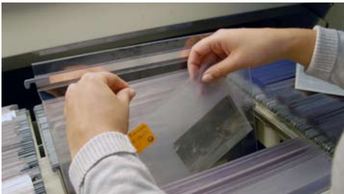
The BMW Group Archive – a customer-oriented service provider

The BMW Group Archive is an integral part of BMW Group Classic. In contrast to many other company archives, however, it not only provides an internal service but is equally open to external customers. This means that members of BMW Clubs can make use of its many services.