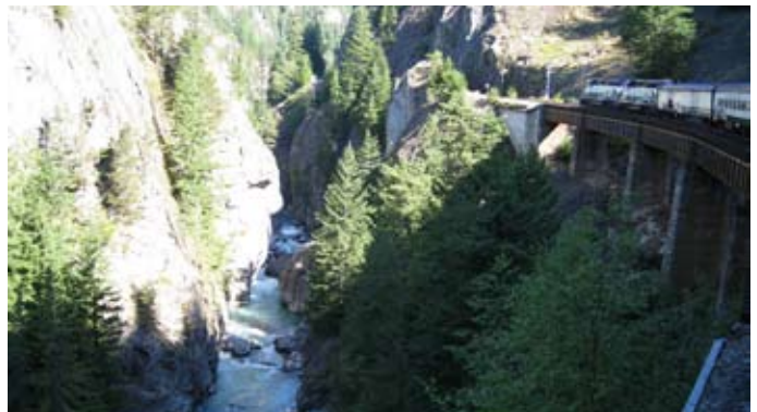
The train winding through canyons on its way to Whistler Village

The afternoon provided an opportunity to enjoy a drive in the country. Jo and I ended up with a BMW 535xi courtesy of BMW Canada. We managed to have some fun and there were no Mounties around to make it expensive. On return to the hotel, BMW Canada and local BMW Club members hosted a fabulous conference closing meal and a few drinks.