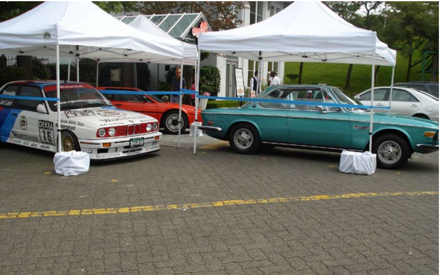
Club members of the BMW Car Club of British Columbia presented their cars in front of the conference hotel

Newsletter of the International Council of BMW Clubs