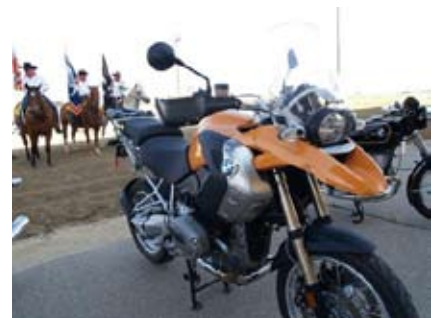
MOA Rally 2008 - The 2008 BMW MOA Rally grand prize bike