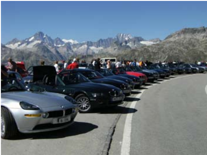
Stopover at the Furkapass

The 46 th BMW Club Europe Meeting (August 28 th – 31 st , 2008) was organized by the Association of Swiss BMW Clubs. In the very heart of Switzerland, in Engelberg in the Lucerne region, around 250 BMWs from 16 nations came together in glorious sunshine for a highly successful rendezvous.