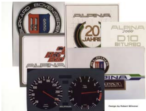
Self-designed birthday cards for the club members

Preparations for 2009 are currently in full swing, anyone who is interested in ALPINA vehicles or who drives one is always more than welcome to join us.