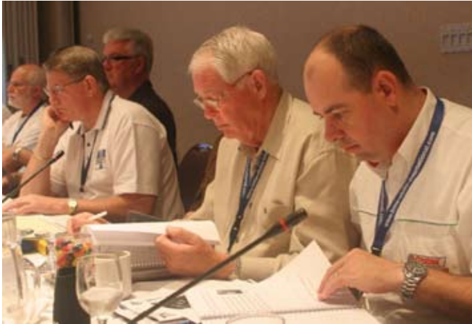
The most important topics this year: BMW Club Survey and the new BMW Club Corporate Identity