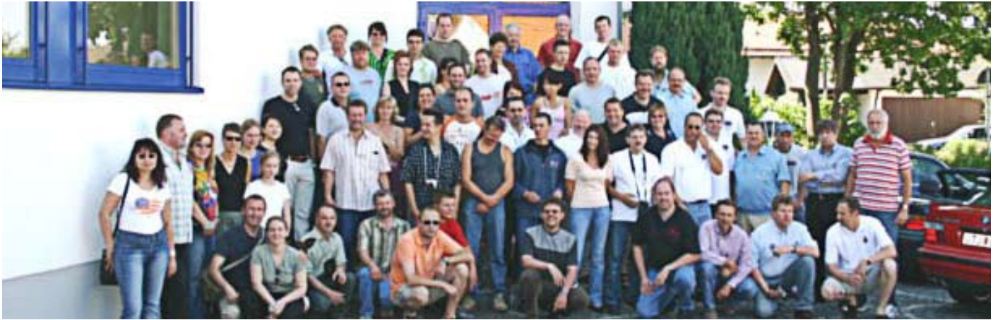
The ALPINA Club is a big family