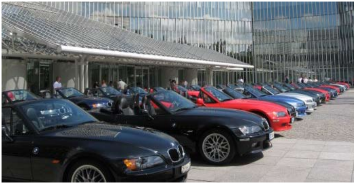
In front of the BMW FIZ – lined up to the millimeter

Off with the roof and let's head south: 4 Z3s from the Rhineland travel to Germering in a great mood and with lots of sunshine. Once they arrive at the hotel, they quickly look out for the others. More and more familiar and unfamiliar faces arrive – hellos, kisses and embraces non-stop. The first evening passes in no time – there is so much to talk about.