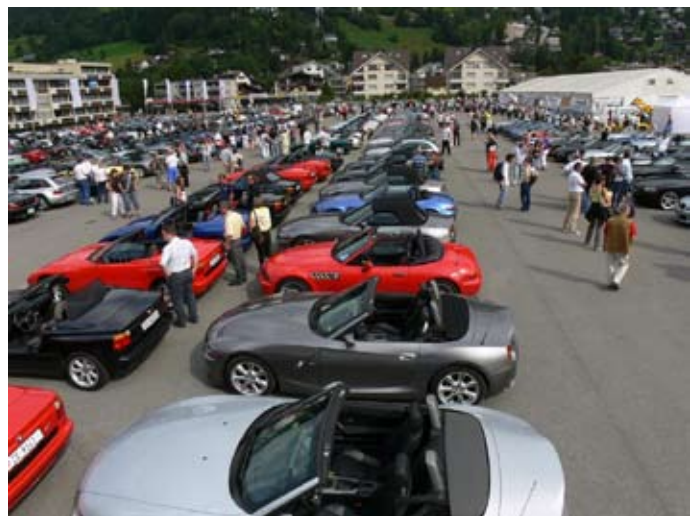
On Saturday – all participants' vehicles at a glance

Once again, the BMW Z vehicles started out from various points in Switzerland and neighboring countries for the drive to Engelberg. Using the existing infrastructure, a new BMW Z record was set. An impressive 371 BMW Z vehicles came together in a single day. In addition there were the various vehicles (cars and motorcycles) of the participants of the BMW Club Europe Meeting in one place – a truly beautiful sight, with lots of car talk and much clicking of cameras.