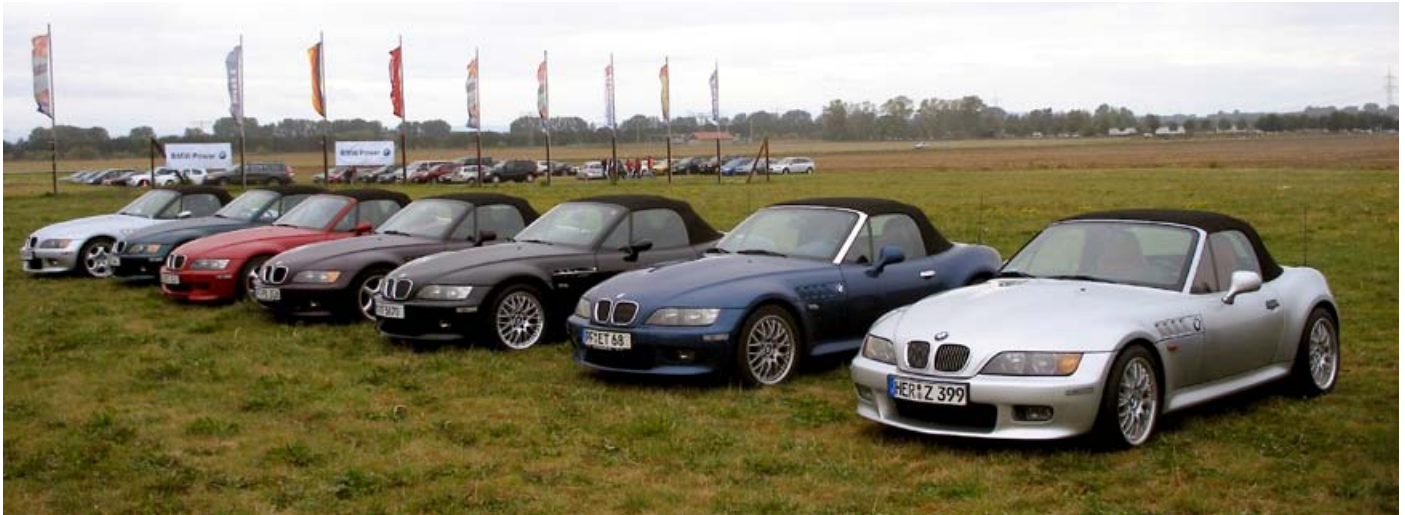
Lined up BMW Z3s of the club members