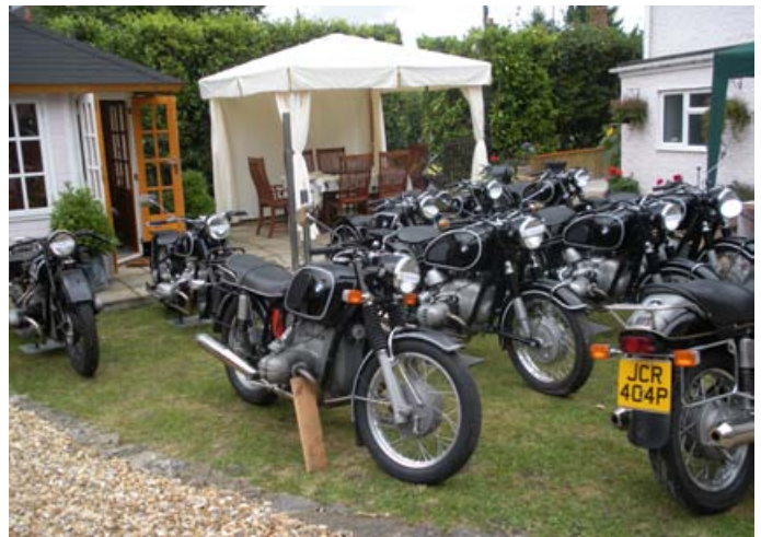
Vintage BMW motorcycles on the Amateur Mechanic's lawn

Visitors' BMWs included a 1928 BMW R42 ridden 40 miles to the event including a ferry crossing from the Isle of Wight, a 1950 BMW R25, R51/3, R50, R60, R69 and R69S. All the bikes were ridden to the meeting with not a trailer in sight.