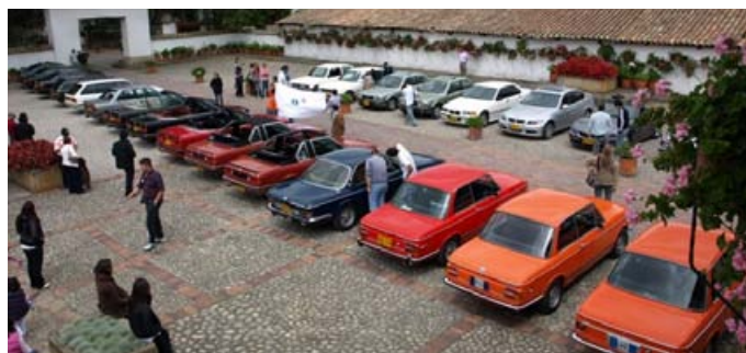
After the bans on import had been cancelled, more BMW vehicles were allowed to enter Colombia