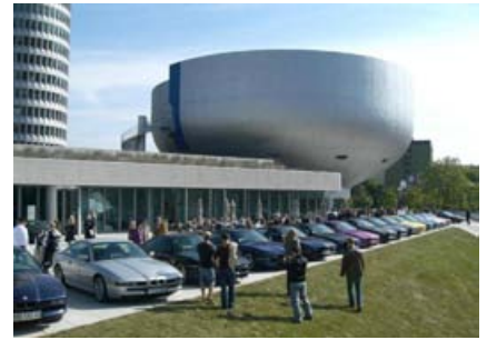
Meeting in Munich: 54 BMW 8 Series vehicles in front of the BMW Museum

You will also find a current calendar of events on our website at www.bmw-clubs-international.com