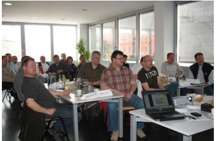
The 2 nd BCD workshop took place at the BMW Motorcycle Center in Munich

19 club members from 8 BMW Clubs were welcomed to the BCD workshop on April 4 th 2009 to discuss Module 1. Just as in Hannover the speakers received positive feedback, much to the satisfaction of the executive committee of the BMW Club Deutschland e. V.