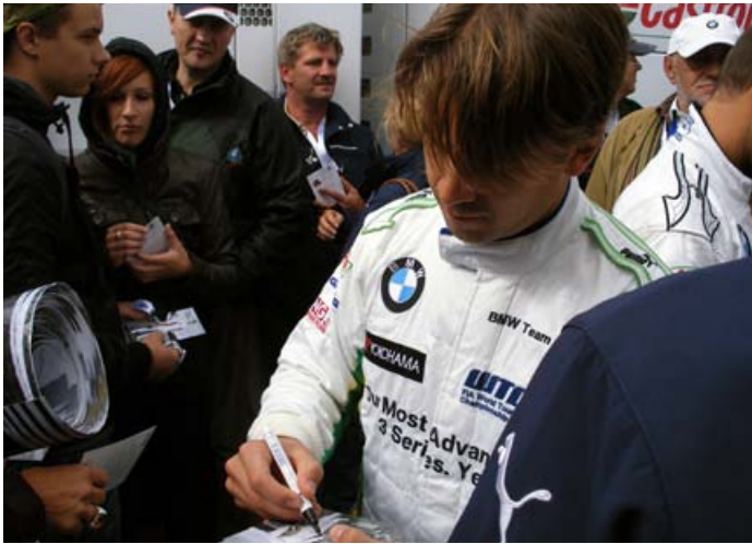
Great rush of people at the "Meet and Greet" with the BMW drivers