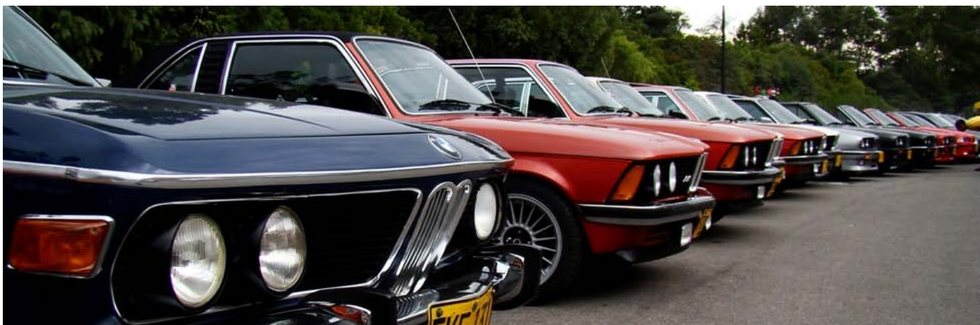
Fully restored BMW E3 and E9