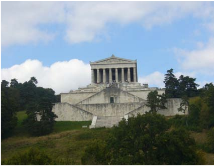
The "Rumestempel" Walhalla is enthroned high above the river Danube

The BMW Riders Association (RA) was formed in 1972 for BMW motorcyclists passionate about the marque and continues to serve the BMW motorcycling community in the United States. The RA became a member of the ICC in 1992 to work with other BMW Auto and Motorcycle Clubs internationally.