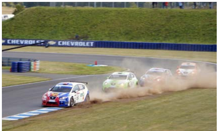
Tough duels and numerous overtaking maneuvers met the expectations of the club members

The Z3 Club Deutschland e. V. members happily drove home again with great memories of an eventful weekend. We would like to express our sincere thanks to BMW Motorsport and the BMW Clubs International Office for their generous invitation, the great gifts and in particular the friendly attitude of the teams at the event, including the drivers themselves. This made the event unforgettable! After all, it is simply not the same when you go to a race just as a spectator.