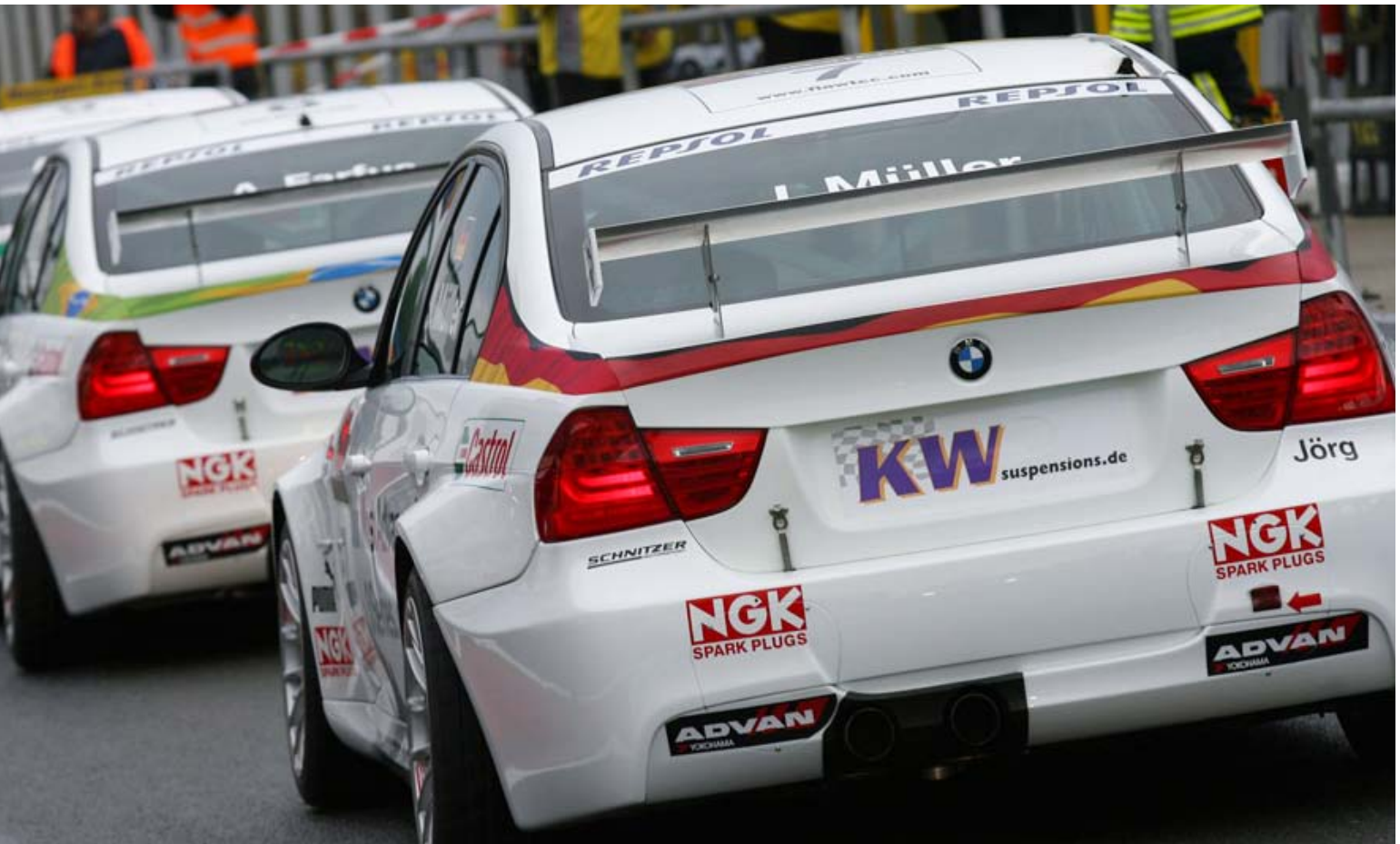
Great performance of the BMW drivers at the WTCC race in Oschersleben

BMW Clubs International Council Newsletter