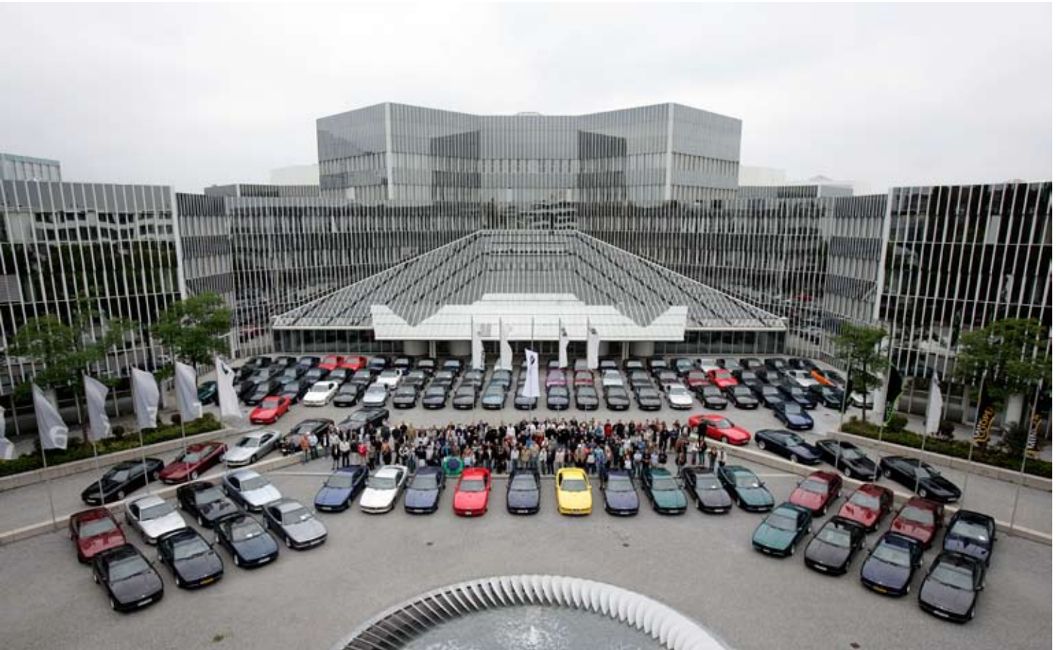
Nearly 200 attendees with their beloved 8 Series vehicles in front of the BMW Group Research and Innovation Center

Newsletter of the International Council of BMW Clubs