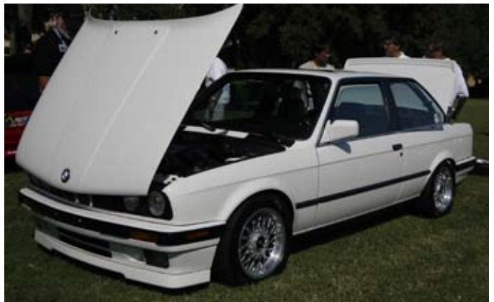
Judging in the concours

the course, and penalties were added for cones that were hit. The competition was fierce, but fun. Attendees gathered back at the hotel on Monday evening for the reception sponsored by the vendors who displayed their goods and services. On Tuesday evening, the Michelin reception honored the BMW E30 M3. The BMW CCA Foundation ran their Street Survival School on Wednesday, sponsored by the Tire Rack and Michelin. This program, now nationwide, teaches teen drivers how to better cope with the dangers of everyday driving by training them in car control, judgment, and emergency situation responses. The festivities moved to Billy Bob's Texas honky tonk on Wednesday night, featuring a barbeque sponsored by Autobahn Motorcar Group of Fort Worth. Highlights included line dancing and riding the mechanical bull. For the precision drivers, Thursday was the Time, Speed, Distance Rally. Forty-six teams took to the Texas roads, pitting their driving and mathematical skills against the rally master's perfect time. Judging in the concours began Friday morning, with cars displayed on the Kimball Art Museum's beautiful lawn. Sponsored by Griot's Garage, the event drew gorgeous examples of BMW vehicles including a 1958 Isetta, 1967 BMW 1600, and a variety of BMW coupés, sedans, roadsters, and M cars.