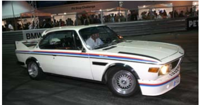
"Hand CSL" drives into the Pit Lane Park